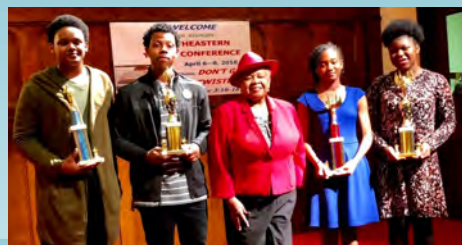
Mr. & Miss NE Youth Conference—2018