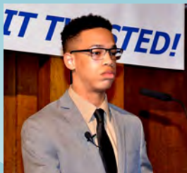
Our Youth Will Speak

Irvington High School Gym 1253 Clinton Avenue Irvington, NJ 07111