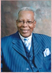
Eugene Lawton Minister